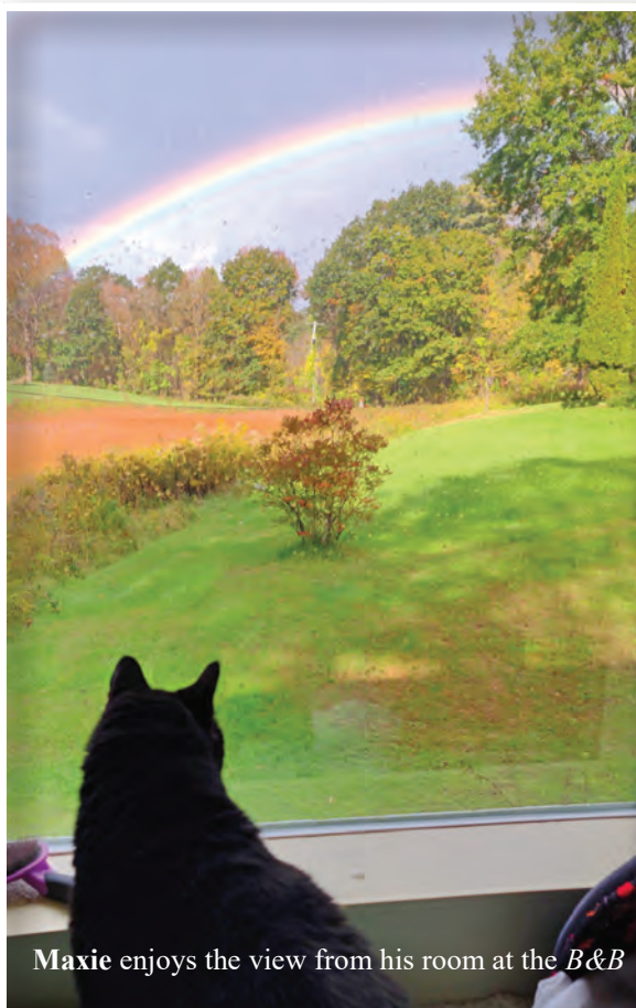
Maxie enjoys the view from his room at the B&B

Many years ago, we boarded 3 cats from North Creek: Blackie , Friskie , and Pinky . Blackie was the girl of the group, a small black cat with a round face and wide eyes. Friskie was a grey and white tiger and diabetic. He couldn't take the car ride and always arrived drooling and frothing at the mouth, totally wiped out. Pinky was a heavy, long-haired cat that also couldn't take the car ride. He would come out of the carrier, wet with drool and urine and immediately jump into the litter box, lay down, then get out and shake. Picture dipping a chicken breast in egg and rolling it in bread crumbs. Friskie and Pinky would slip and slide around the room and Blackie would watch from a cubby, round faced and wide eyed with her head slightly tilted as if to say, "Don't look at me!"